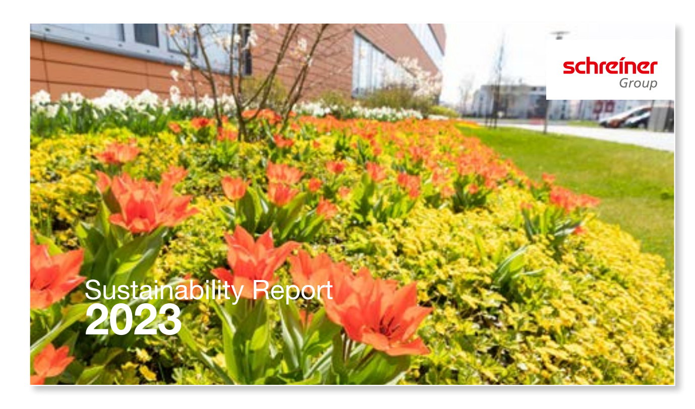
Schreiner Group's 2023 Sustainability Report can be found at <a href="https://www.schreiner-group.com/Sustainability-Report">www.schreiner-group.com/Sustainability-Report</a>